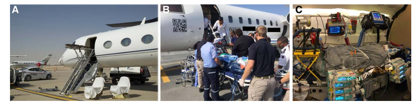
Figure 3. (A, B, and C). An example of air ambulance. Note the special mechanism for lifting patient and difficult access.