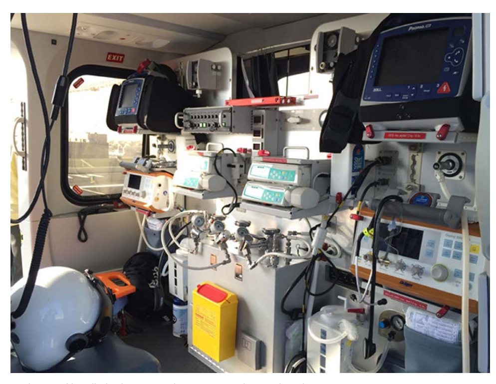
Figure 2. Helicopter lay out. Note limited space and access to patient and equipment.