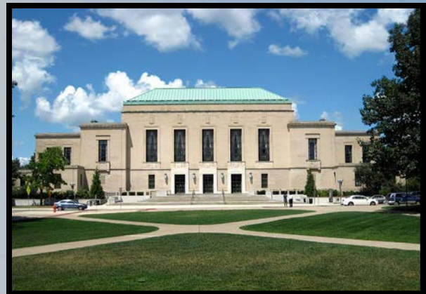
Rackham Auditorium in Ann Arbor, MI

The latest information on ELSO & Collaborative Meetings can be found here .