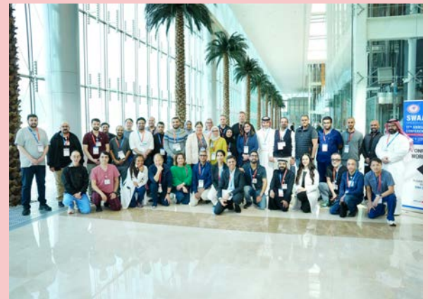
Train the Trainer participants at SWAAC ELSO