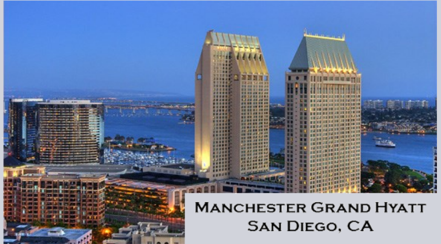
MANCHESTER GRAND HYATT SAN DIEGO, CA

Pre-Conference Symposium September 15-16 www.elseo.org