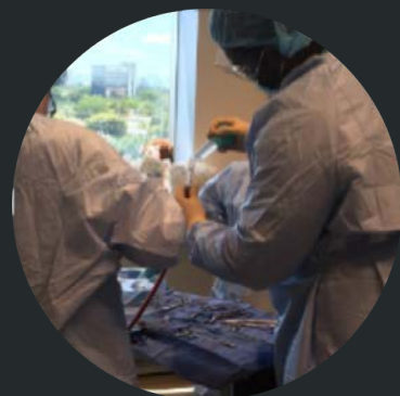
Esteemed faculty at ELSO conferences, learners in Simulation and Cannulation courses