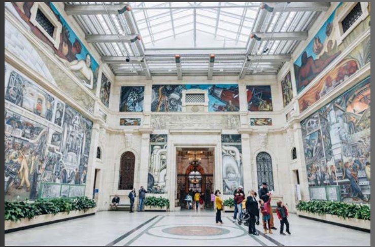
↑ Detroit Institute of Art